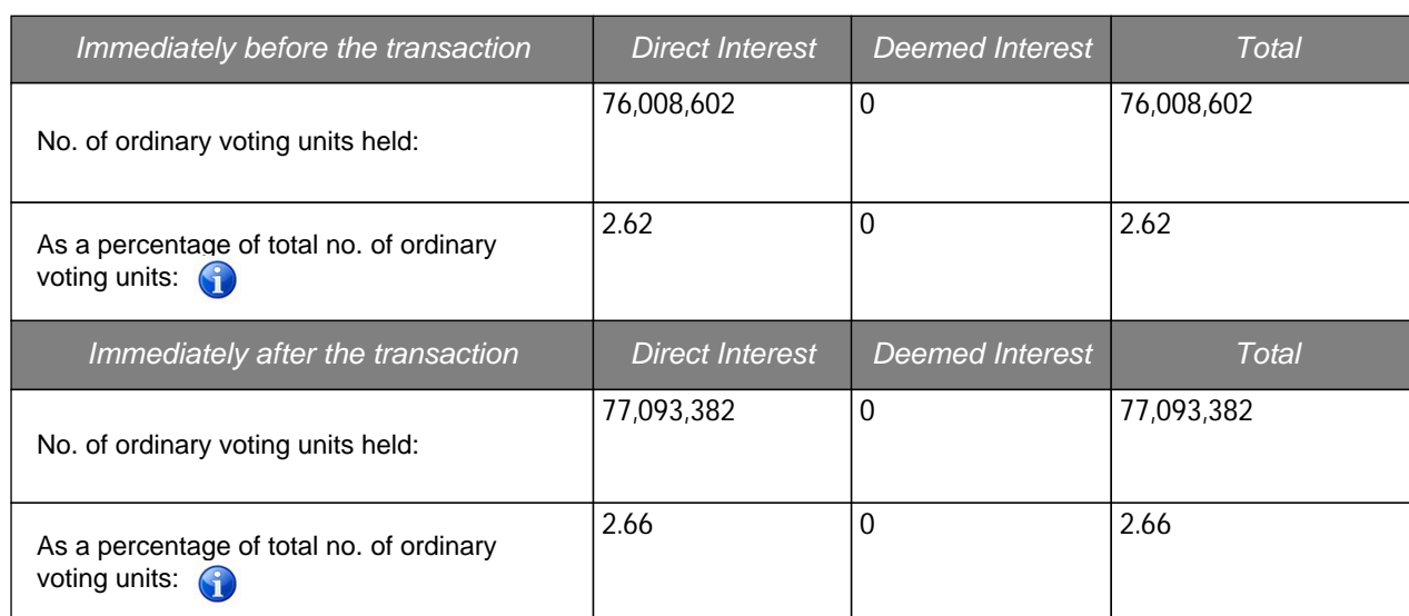
Table 1. Change in respect of ordinary voting units of Listed Issuer